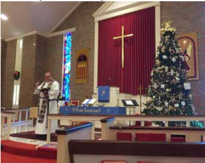
Pastor Wade Lindstrom preached on December 8.