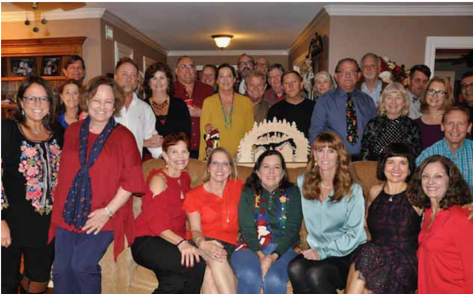
The Seekers Class had a great turnout at its annual Christmas gathering recently. Can you name everyone in the photo? If not, check out the Seekers Sunday School class on Sunday mornings!