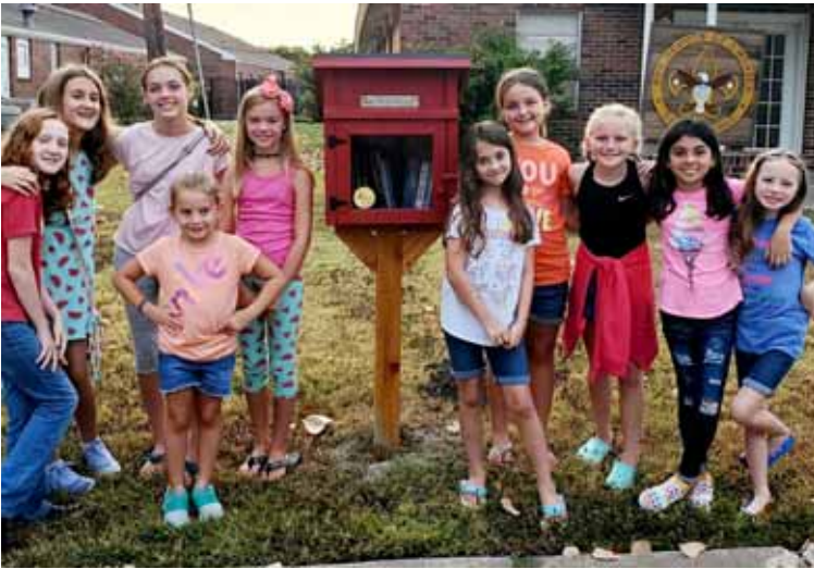
LittleFreeLibrary Installed Outside St. John's Scout Hut A big thank you to Girl Scout Troop # 96067 for installing a new "Little Free Library" on the St. John's campus on July 24. The troop will be stewarding the library! Thank you, Scouts..