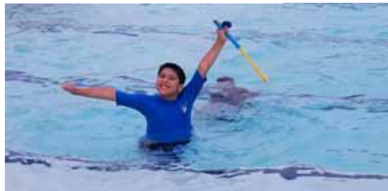
Cub Pack Enjoys Varied Summer Activities